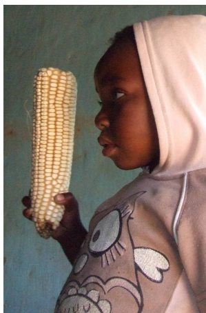
Child with cob