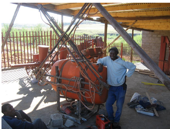
Molemo and Molemo Lethe in the new machinery

Over the last few months – the winter months – the team has completed the tool store and the machinery storage shed (pictured below). This simply built shed provides protection from the elements and protects the machinery. It allows repairs and maintenance to be carried out in relative comfort and protection from both the heat in summer and the intense cold of winter.